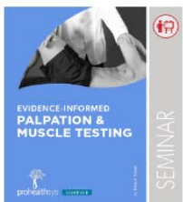
0110 Evidence Informed Palpation and Muscle Testing