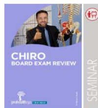
CHIRO BOARD EXAM REVIEW