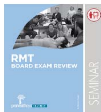
RMT BOARD EXAM REVIEW