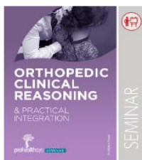
Orthopedic Clinical Reasoning