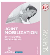
JOINT MOBILIZATION OF THE SPINE, NECK & PELVIS