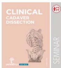
0201 Advanced Clinical Cadaver Dissection