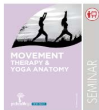
0301 Movement Therapy and Yoga Anatomy