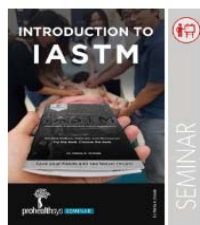
0701 Introduction to IASTM