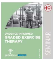
0401 Evidence Informed Graded Exercise Therapy