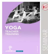
0400 Yoga Teacher Training